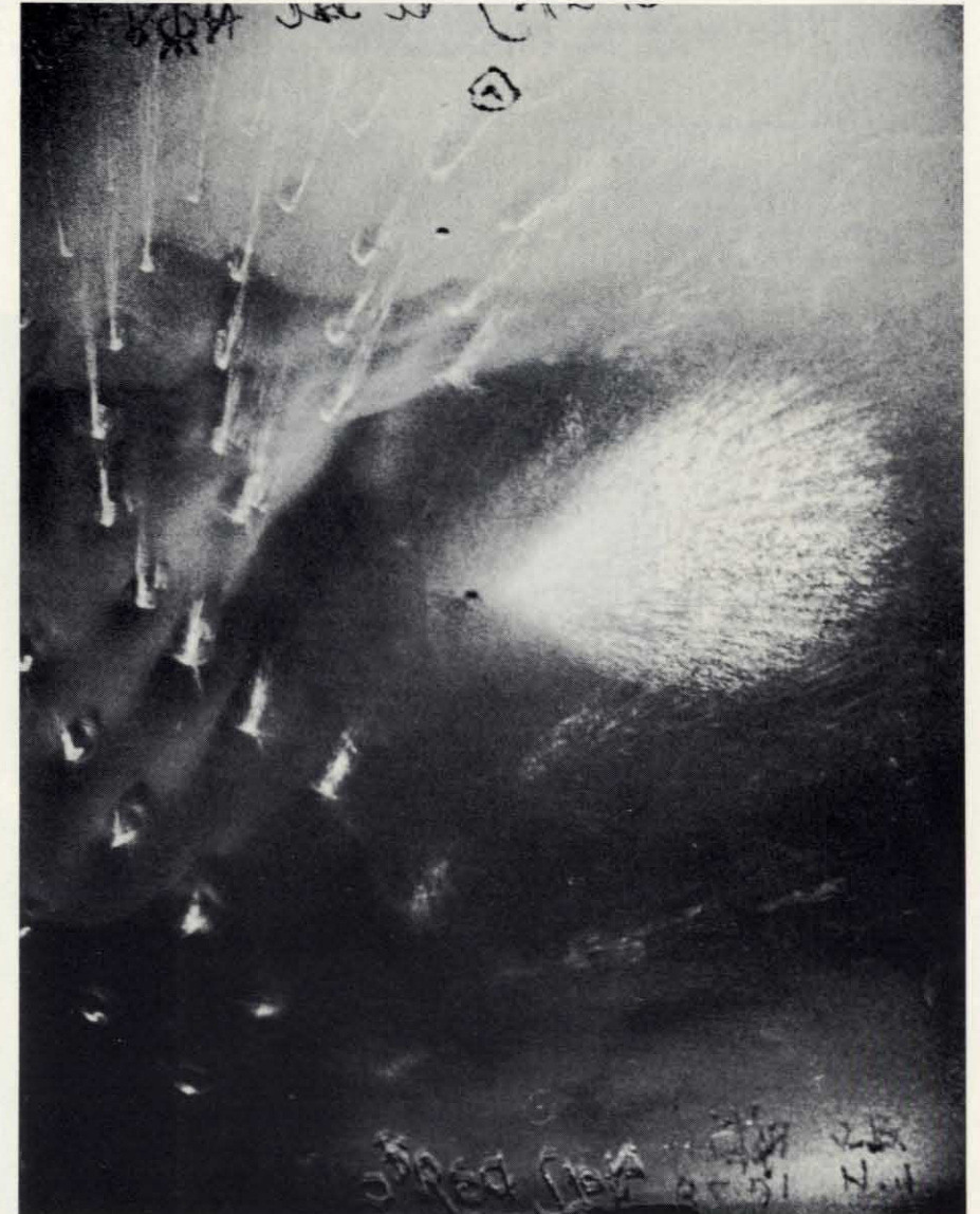
"Holokinetic Red Lion"